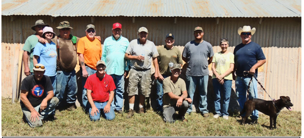
FILE PHOTO: NWTFS DIRECTORS WORK DAY AT THE 4 AMIGOS RANCH TO GET READY FOR THE GIRLS DEER HUNT IN NOVEMBER AND THE BOYS DEER HUNT IN DECEMBER. LADY GUIDES FOR THE 2018 GIRLS DEER HUNT AND MEN GUIDES FOR THE BOYS DEER HUNT. GO TO nwfts.org AND FILL OUT THE BACKGROUND CHECK FORMS TODAY. YOUR HELP IS GREATLY APPRECIATED.

A boat dealer in the Waco area alerted game wardens that a car dealer in Robinson was selling boats without a marine dealer license. A warden located the car dealership late on a Saturday night and recorded three boats, motors and trailers on the lot. After checking the history of the vessels through different databases and resources, the warden returned to the dealership during business hours. He noticed a pontoon boat he had observed previously was missing and asked about it. The owner proudly stated he had sold it, adding that the vessel was there on consignment. The car dealer asked if there was a problem, to which the warden replied that there was not problem, but he needed to see their marine dealer license. The owner said