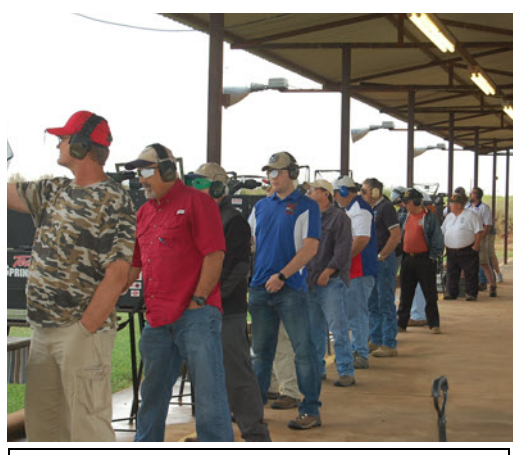
2017 RED RIVER COMPETITION SPONSORED BY NORTHWEST TEXAS FIELD AND STREAM.

Wichita Falls MPEC (5th & Burnett) 940-692-3766 www.joetomwhite.com