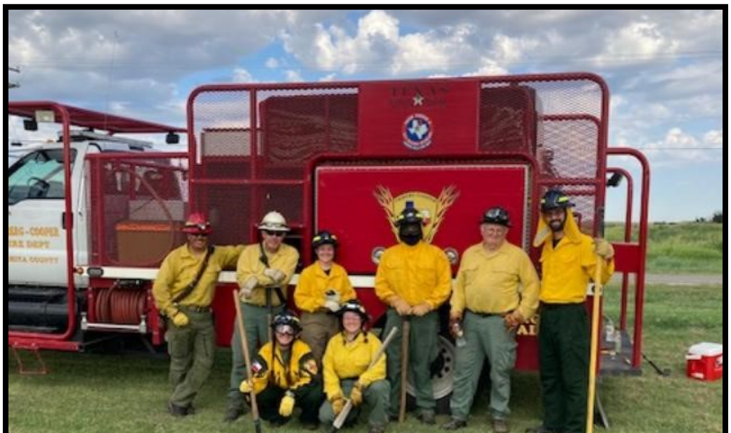
Friberg Cooper Volunteer Fire Dept. and the big burn.