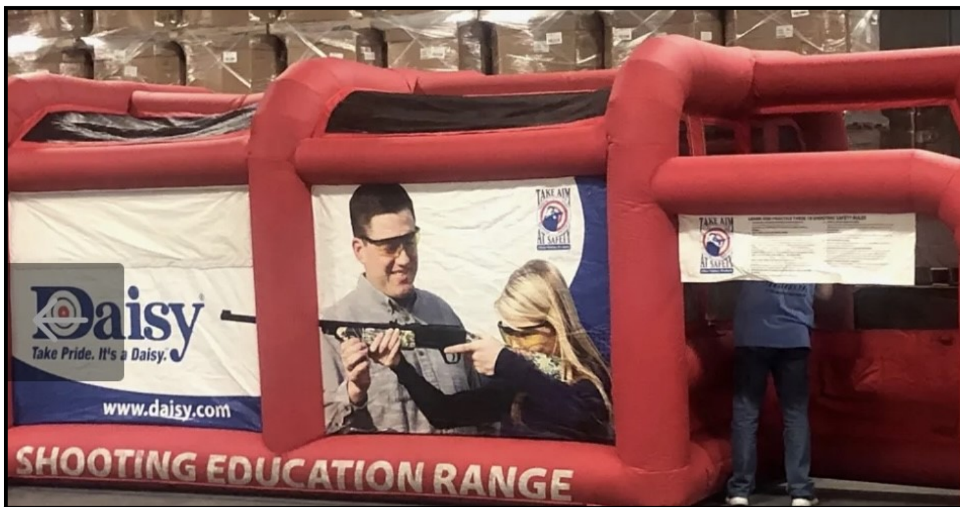
Seymour Gun Show Aug. 16th&17th