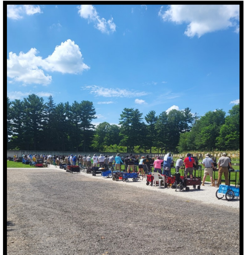
Pistol firing Line At Camp Perry.