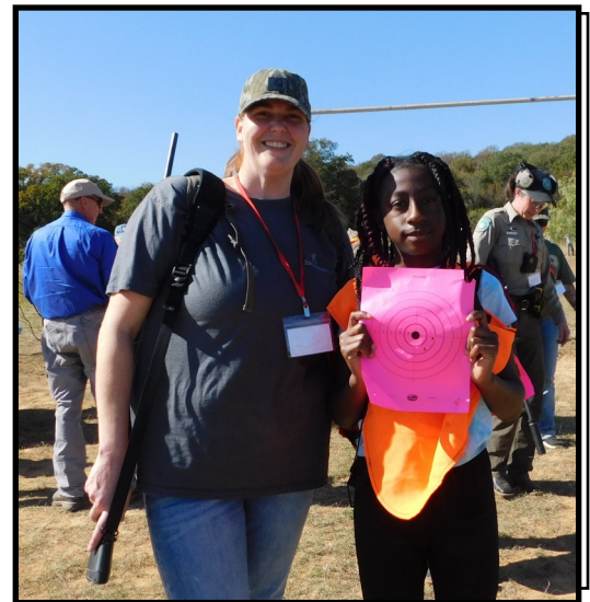
Girls Deer Hunt –2025 Practice Time