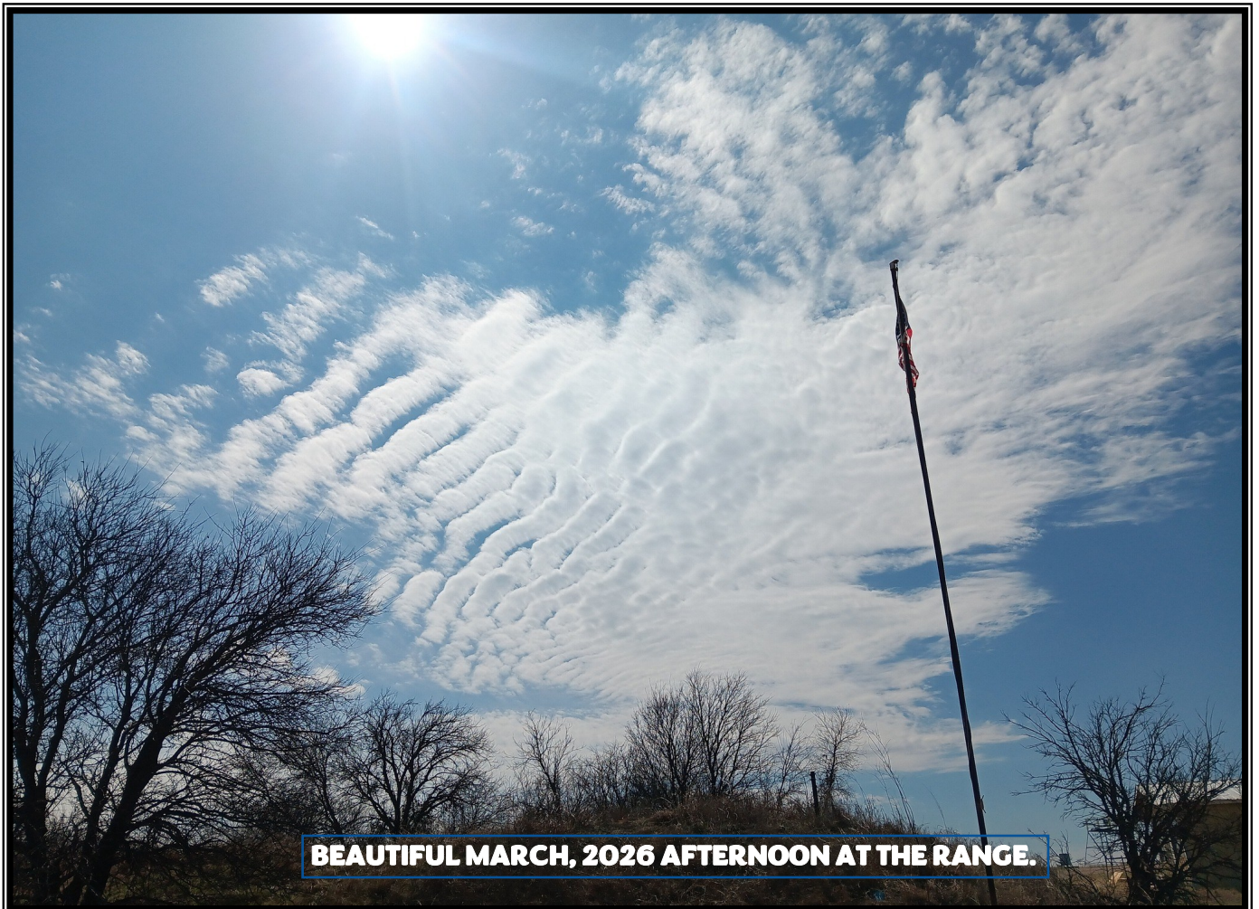
BEAUTIFUL MARCH, 2026 AFTERNOON AT THE RANGE.